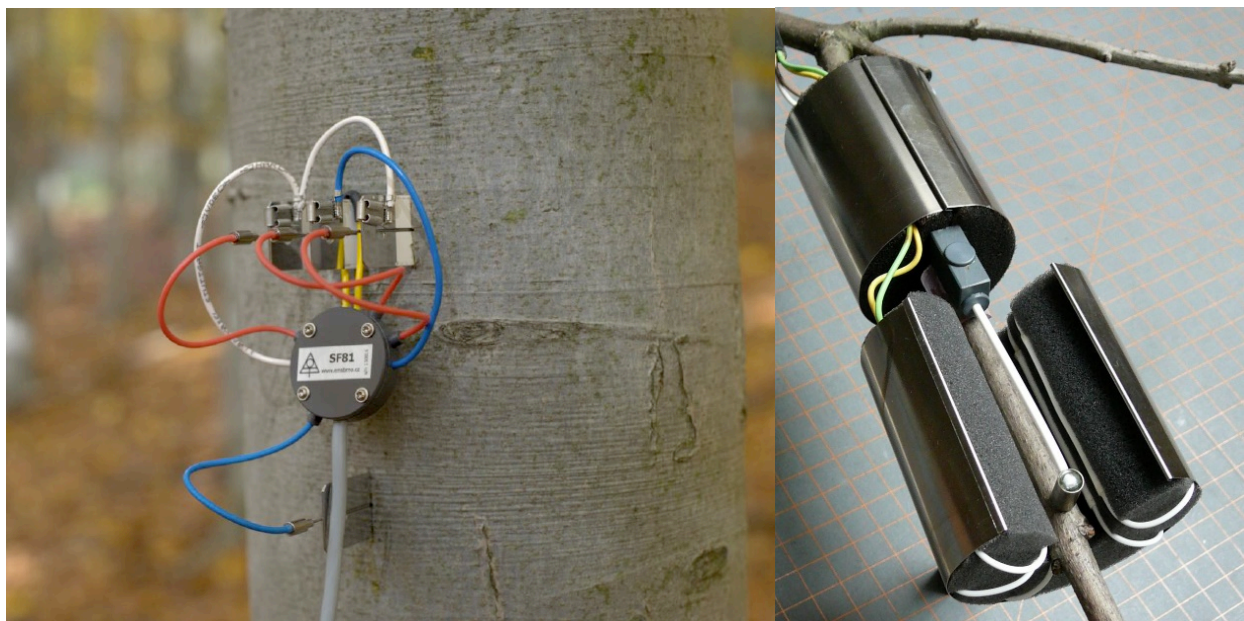
Figure 3.7.1 THB sap flux sensor (left) and “baby” THB sensor manufactured by EMS (right).

The trunk segment or tissue heat balance (THB) method requires no calibration and is frequently used as a standard against which other thermal tracer methods are evaluated and/or calibrated (Lundblad et al., 2001; Renninger & Schäfer, 2012). Commercially available THB sensors consist of three or more uniformly, continuously heated, plate electrodes and one unheated “reference” electrode located vertically below the central heated electrode (Figure 3.7.1 left). Temperature sensors located in the centre of each plate electrode measure temperature differences between the plates. The THB method calculates the temperature balance of the well-defined heated trunk volume in a manner that accounts for conductive transfer through the woody tissue and convective transfer due to water flow (Čermák & Nadezhdina, 2011). THB is suitable for large trees and can also be applied to smaller diameter stems (0.6–2 cm) using modified sensors (e.g. environmental measuring systems (EMS) “baby” sensors, Figure 3.7.1 right). Measurement inaccuracies have been reported during low flow conditions and in cases where the sensors are installed into stems with narrow sapwood (Čermák et al., 2004). THB sensors require more power input (0.6–1 W) than other methodologies.