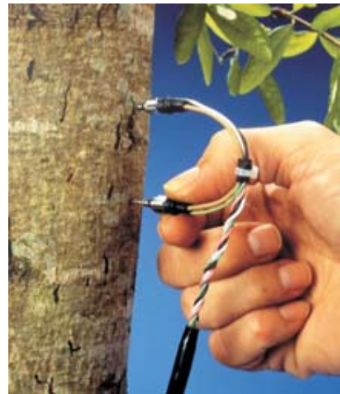
Figure 3.7.3 A thermal dissipation sensor as manufactured by Dynamax .

The thermal dissipation (TD) method (Granier, 1987) is the most broadly used methodology for sap flux measurements (Poyatos et al., 2016). TD sensors consist of one unheated reference needle and one heated needle, each containing a thermocouple (Figure 3.7.3). The temperature difference between the upper heated needle and the lower unheated needle is empirically related to sap flux density (Granier, 1985). TD sensors are frequently manufactured in-house at very low cost and require a relatively low power use of 0.2 W, making them ideal for studies with high measurement replication. TD sensors are known to underestimate sap flux (Steppe et al., 2010; Renninger & Schäfer, 2012), but post-processing corrections for needle penetration into non-conductive wood (Clearwater et al., 1999) and nocturnal flow (Oishi et al., 2008) can improve accuracy. They are sensitive to radial and circumferential variation in sap flow rate within the stem. With careful data processing (available open-source through Oishi et al., 2016), this method can yield quantitative measurements without calibration in the lab prior to deployment. Measurements from TD sensors have been shown to align with data collected through porometry, whole-tree gas exchange, gravimetric water loss, above and below canopy EC measurements, and estimates from the Penman-Monteith equation (Renninger & Schäfer, 2012).