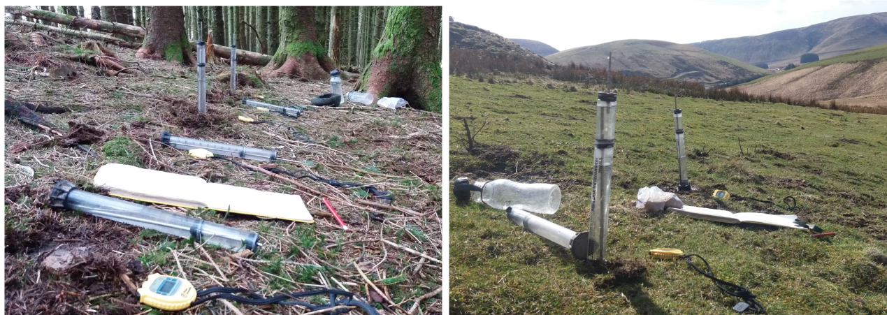
Figure 3.2.1 Setup of infiltration measurements in a forest (left) and on a grassland soil (right) using mini-disk infiltrometers and stop watches.

measurements can be found in Angulo-Jaramillo et al. (2000), Mualem (1986), and Šimůnek et al. (2003, 2008).