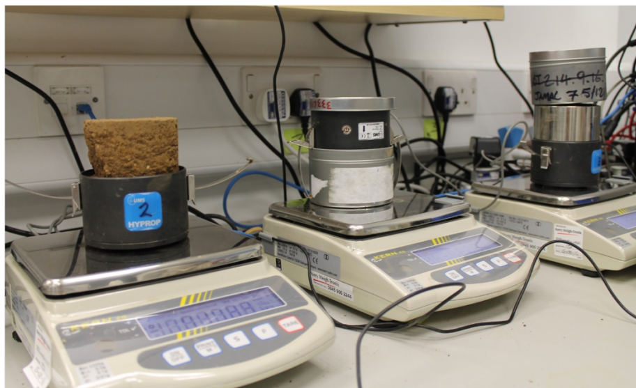
Figure 3.3.2 A laboratory setup for demonstration showing three balances with the HYPROP pressure transducers and the soil cores on top (bottom) Note: soil core remains in the cylinder during water loss but was removed for demonstration.

The HYPROP® system performs the evaporation method using two tensiometers and a weighing balance (Figure 3.3.1 and 3.3.2) to provide estimates of \Theta(h) and K(h) (Schindler et al., 2010). The WP4 (models T and now C) Water Potentiometer is a hygrometer that performs the chilled mirror dew-point method to measure soil moisture potential at the dry end of the WRC. The gravimetric moisture content, \Theta_g , of the WP4 samples are then determined in the standard method and converted to volumetric moisture content, \Theta_v , to determine \Theta(h) at the dry end.