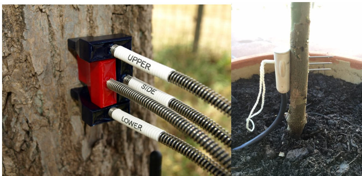
Figure 3.7.2 HFD sensor HFD8-100 manufactured by ICT international (left) and HPV sensor manufactured by Edaphic Scientific (right).

The heat field deformation method (HFD) (Nadezhdina et al., 2008) is a constant-heat technique that consists of one heated needle and three measurement needles (1–1.5 mm diameter), each containing several thermocouples. Generally, measurement needles are placed above, below, and to the side of the heater (Nadezhdina et al., 2012; Figure 3.7.2 left), although alternative configurations have been used (Čermák et al., 2004). Sap flow is calculated based on the ratio of temperature differences between the vertical and lateral thermocouple pairs. Commercially available HFD sensors contain multiple (up to ten+) thermocouples along their length and are ideal for monitoring sap flow at multiple radial depths (Nadezhdina et al., 2012). HFD sensors produced by ICT International require 0.06–0.08 W of electrical power per cm of sensor length (Nadezhdina et al., 2012).