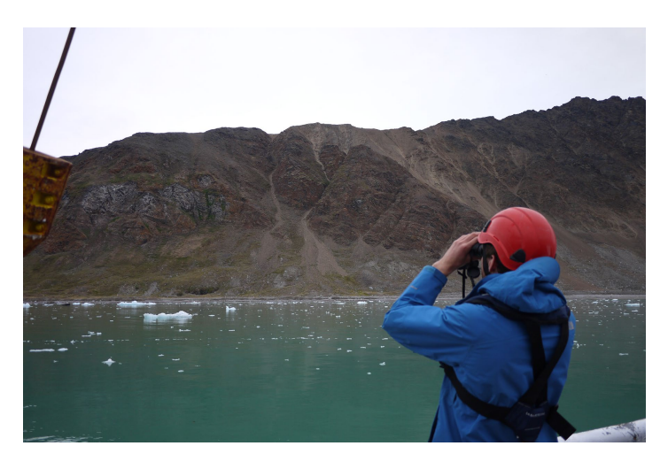
FIGURE 2. Observation of bird cliffs was made possible with access by ship. The green coverage below the cliffs to the left marked the presence of birds (i.e., there is guano that encourages plants). This was a striking contrast, as nearly all landscape observed from the ship was brown, black, or gray.

Mira: Yeah, you can sit inside and learn all the theory though it is truth and that is what is happening outside. I think that for me personally it is, you are learning it in a totally different way when you are out, and I just think it's a lot more easy to get "in" and to remember when you are out there where it is actually happening, and you can see it and relate to what you see and learn.