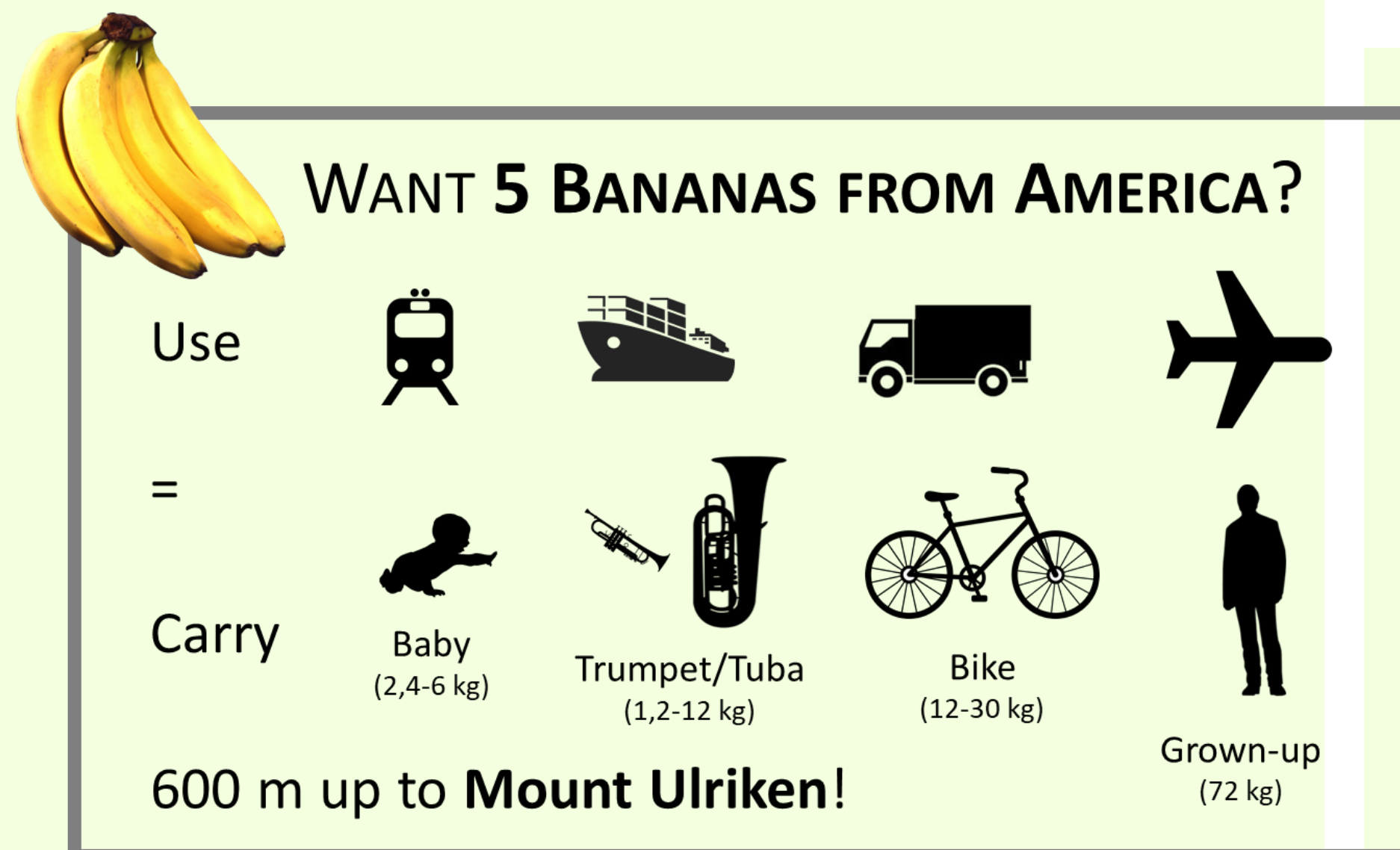
Fig. 1: Energy costs for importing 1kg bananas from oversea using different means of transport

Promoting seasonal and local food can help decreasing the ecological impact of our current food industry. Means of transport increase CO2 emission of fruits and vegetables significantly (Fig. 3).