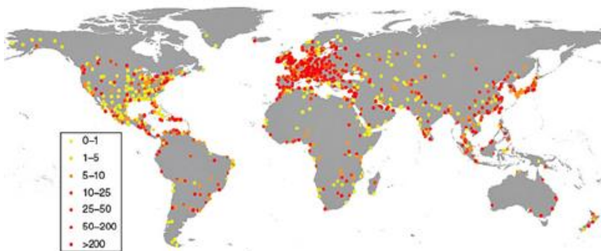
Figure showing the amount of invasive alien species around the world (Hoddle, CISR)

Invasive alien species are non-native animals, microbes, diseases, or plants, that are pests (Hoddle). They are often native to another country or area, but are considered "invasive" when they "invade and establish populations in new areas and the resulting uncontrolled population growth and spread causes economic or environmental problems" (Hoddle). "On average, California acquires around nine new species of macroinvertebrate per year, of which around three will become pests. This is a rate of one new species every 40 days" (Hoddle).